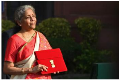
Union Finance Minister Nirmala Sitharaman