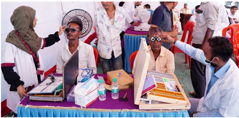
Photo: The eye camp at Yash Terminal organised by Allcargo Logistics

Commenting on the initiative, Arathi Shetty, Non-Executive Director, Allcargo Logistics said, "According to Ministry of Road Transport and Highways, road transport makes up almost 60 percent of freight traffic and that makes the role of the country's more than 10-million strong truckers' community extremely critical in transporting goods with the required level of safety and efficiency.